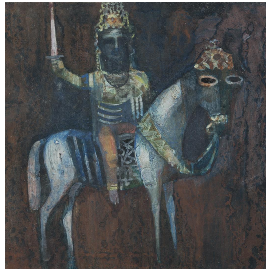
Man on Horse, Undated, Ganesh Pyne, MAC.01291