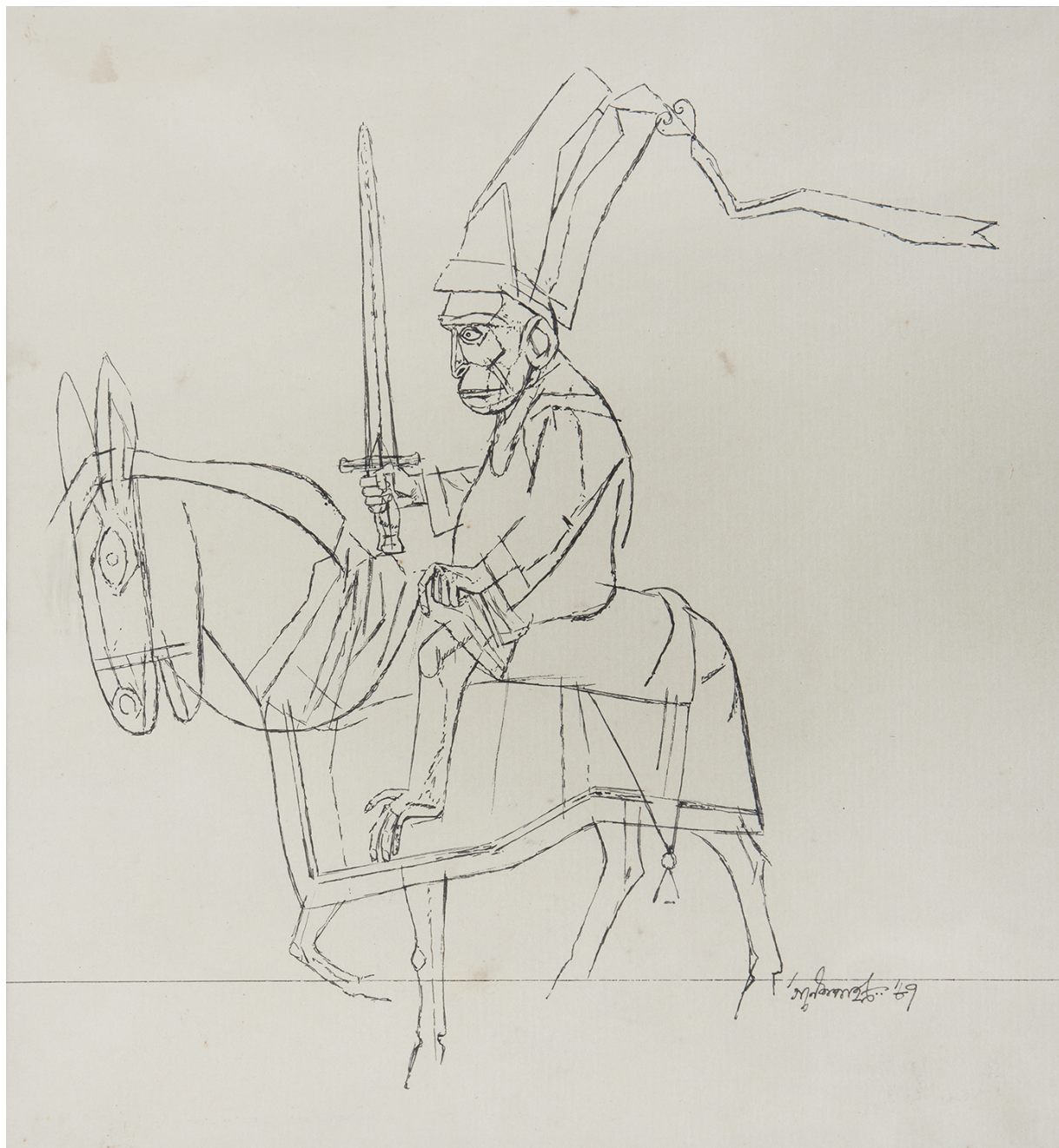
The Rider, Ganesh Pyne, 1969, H. 32.5 cm, W. 37.5 cm, MAC.01300

Here is a line drawing by Ganesh Pyne from the MAP collection. Choose Pyne's favourite colours (black, dark blue, yellow and brown) to colour these. Or let your imagination fly and fill it up as you like!