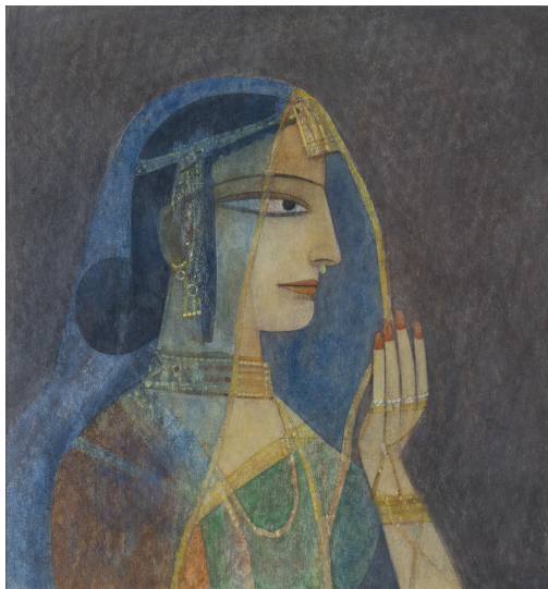
Nayika, 1989, Ganesh Pyne, MAC.01357

Imagine that the woman and the man riding a horse are characters in a fairy tale you are to write. But first, begin with a character sketch!