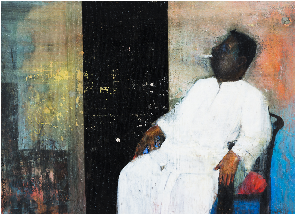
Babu Sitting, Ganesh Pyne, Undated, H. 14 cm × W. 18 cm, MAC.01290

Ganesh Pyne was a notable contemporary artist of India. Pyne grew up on the folktales, mythology and fairy tales of West Bengal that his grandmother told him, which later became part of his paintings. Through his career, he worked with various mediums like ink, watercolour and tempera. He developed his own style of fantasy and dark imagery around themes of mythology.